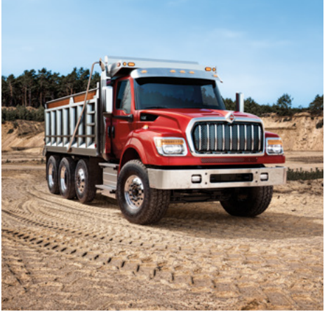
¹International™ Financial services and financing are provided by Navistar Financial Corporation.