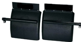
Quarter Fenders FLT03100406