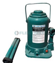
Hydraulic Bottle Jack FLTHBJ20TLB

Compact, sleek and heavy duty, these jacks provide precision hydraulics for a steady lift and ease of use. 20 ton weight rating, low profile, L=6.5", W=8", H=7.48".