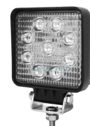
Spot Light FLTWL36009SP

High impact polycarbonate lenses, 9 LED, 1600 lumen.