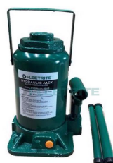
Hydraulic Bottle Jack FLTHBJ20T

Compact, sleek and heavy duty, these jacks provide precision hydraulics for a steady lift and ease of use. 20 ton weight rating, L=9.65", W=8", H=12.75".