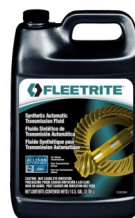
Allison Synthetic ATF TES FLTATF295GKK

A premium synthetic universal powershift and automatic transmission fluid that is TES-295 approved.