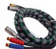
Trailer Electric Cable and Air Hose FLTC3151

Thicker tube springs plus thicker wire = increased durability. 12 feet, black/green.