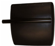
Quarter Fender Kit FLT1900KIT

Contains 2 poly fenders, quarter fender, 2 top flaps with hardware. Standard fit.