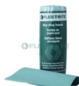
Shop Towels FLTSTR60

Super absorbent, great for wiping off grease and stains. 60 Count