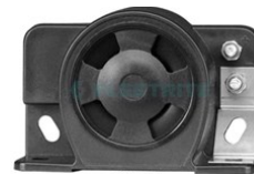
Back-Up Alarm FLTBUA12V

Features rugged ABS, waterproof construction, stainless steel terminals, 12V, and 97 decibels.