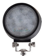
Work Light FLTWL47006FL

High impact polycarbonate lenses, round, 6 LED, 1350 lumen.