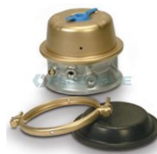
Brake Chamber FLT3030SB28

Aftermarket quality approved, cold rated to -40, piggy back kit, 3030 model, standard stroke.