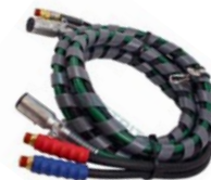
Trailer Electric Cable and Air Hose FLTC3171

Thicker tube springs plus thicker wire = increased durability. 15 feet, black/green.