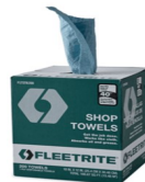
Shop Towels FLTSTB200

Super absorbent, great for wiping off grease and stains. 200 Count